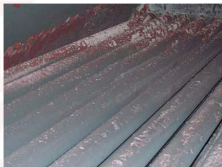
After AJ Chemical 1